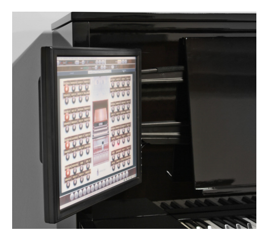
Touchscreen can easily be placed behind the music rack

Changing stops is easy with the 17" touch screen at eye level. After use, the screen can be stored behind retractable construction.