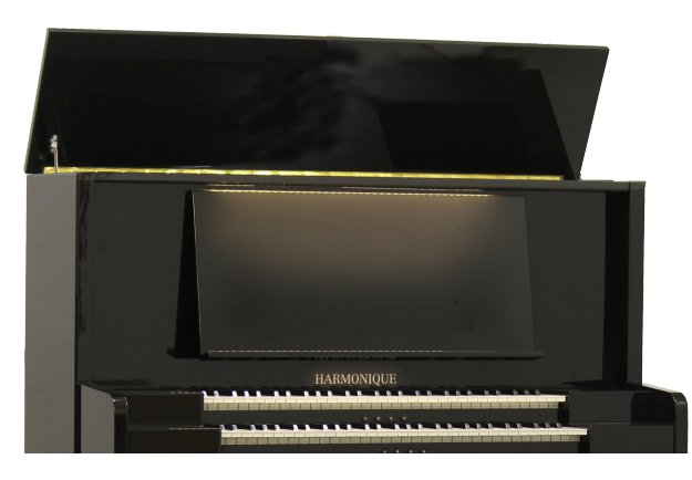
Adjustable lid to position sound