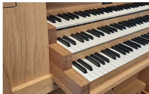
▲ Optionally expandable with a 3 rd manual

▼ Unique and durable slide-in construction