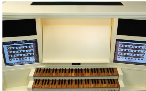
▲ Optional speakers in the top