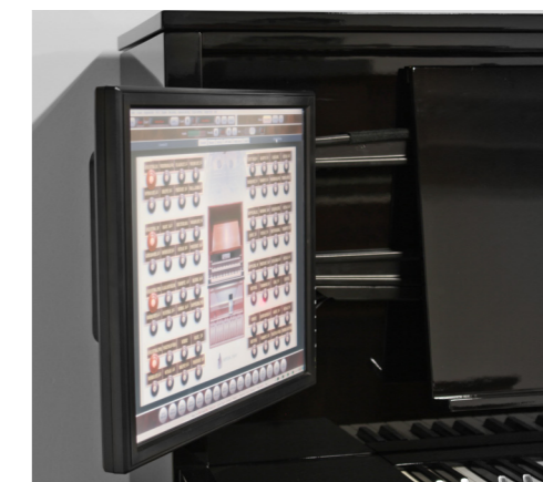
Touchscreen can easily be placed behind the music rack