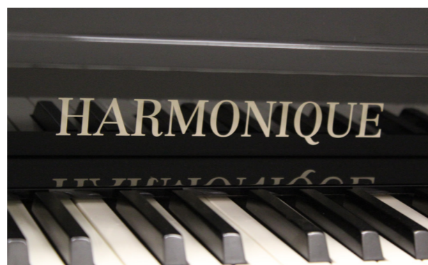
▲ Beautiful glossy piano look