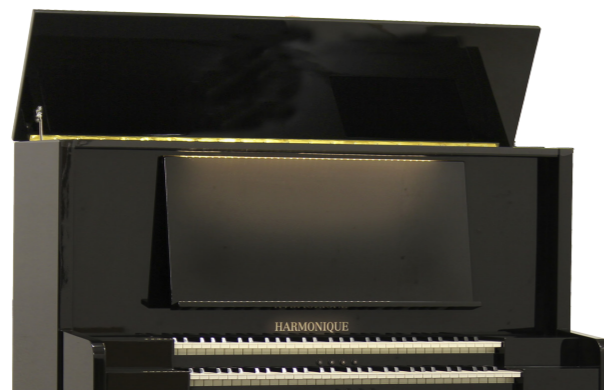
▲ Adjustable lid to position sound

We can offer you tailor-made advice and excellent guarantee. Do you need help? Through internet we can offer you the help you need.